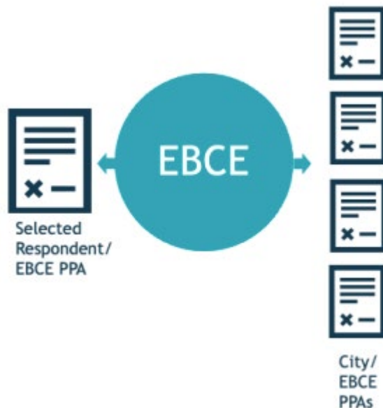
Figure 1: EBCE PPA Sleeve Structure

EBCE developed a standard PPA with the Phase 1 city attorneys that could be issued in a Request for Offers (RFO) so that developers would understand the terms of engaging with EBCE and our member agencies in this program.