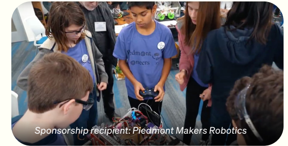
Sponsorship recipient: Piedmont Makers Robotics

Three times per year, Ava reviews applications for local sponsorships. We’ve funded dozens of local groups, making our service area a vibrant community. Visit AvaEnergy.org/community-sponsorships to learn more.