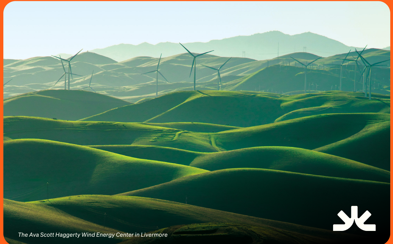
The Ava Scott Haggerty Wind Energy Center in Livermore