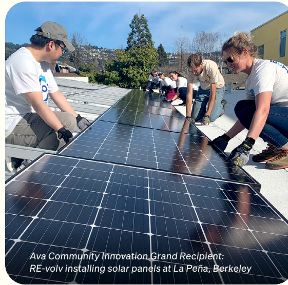
Ava Community Innovation Grand Recipient: RE-volv installing solar panels at La Peña, Berkeley

Ava Community Energy (formerly East Bay Community Energy) has served customers since 2018. We are locally controlled, with a Board of Directors composed of an elected official from each city we serve, who meet publicly each month.