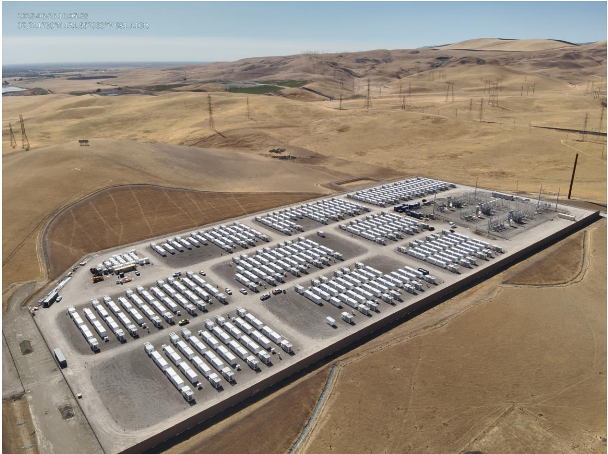
1 Kola Energy Storage Facility, San Joaquin County, CA